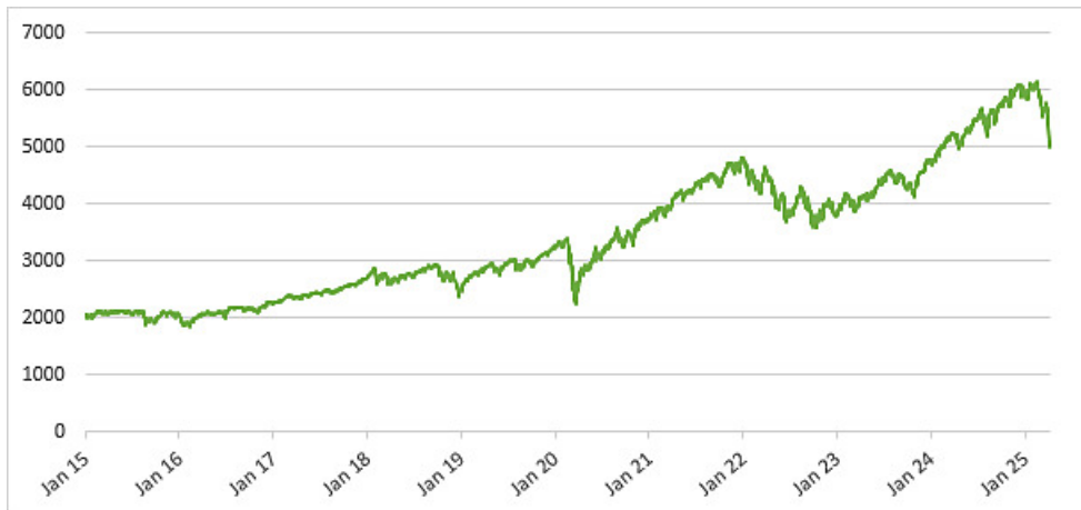
Historical Performance of the SPX

The following graph shows the daily historical performance of the SPX in the period from January 1, 2015 through April 8, 2025. We obtained this historical data from Bloomberg L.P. We have not independently verified the accuracy or completeness of the information obtained from Bloomberg L.P. On the pricing date, the closing level of the SPX was 4,982.77.