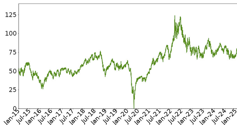
Historical Performance of the April 2026 Futures Contract for WTI Light Sweet Crude Oil

This historical data on the WTI Crude Oil Futures Contract is not necessarily indicative of its future performance or what the value of the notes may be. Any historical upward or downward trend in the price of the WTI Crude Oil Futures Contract during any period set forth above is not an indication that the price of the WTI Crude Oil Futures Contract is more or less likely to increase or decrease at any time over the term of the notes.