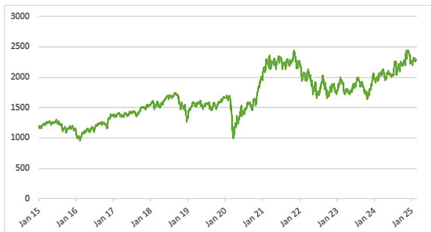
Historical Performance of the RTY

The following graph shows the daily historical performance of the RTY in the period from January 12015 through the Strike Date. We obtained this historical data from Bloomberg L.P. We have not independently verified the accuracy or completeness of the information obtained from Bloomberg L.P. On the Strike Date, the closing level of the RTY was 2,261.743.