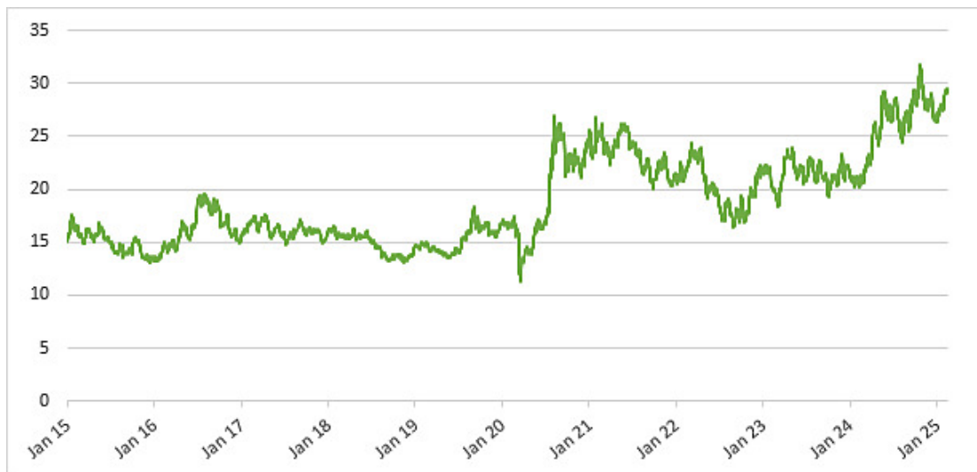
Historical Performance of the Underlying Fund

This historical data on the Underlying Fund is not necessarily indicative of the future performance of the Underlying Fund or what the value of the notes may be. Any historical upward or downward trend in the price of the Underlying Fund during any period set forth above is not an indication that the price of the Underlying Fund is more or less likely to increase or decrease at any time over the term of the notes.