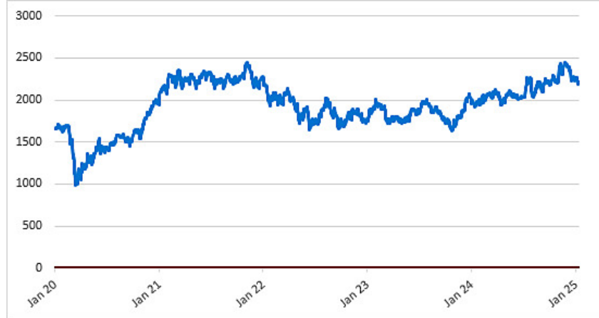
RTY Daily Index Closing Values January 2, 2020 to January 13, 2025

The following graph sets forth the daily index closing values of the RTY for the period from January 2, 2020 through January 13, 2025. The related table sets forth the published high and low index closing values, as well as end-of-quarter index closing values, of the RTY for each quarter in the same period. The index closing value of the RTY on January 13, 2025 was 2,194.404. We obtained the information in the graph and table below from Bloomberg L.P., without independent verification. The RTY has at times experienced periods of high volatility, and you should not take the historical values of the RTY as an indication of its future performance. No assurance can be given as to the level of the RTY on the valuation date.