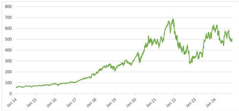
Historical Performance of ADBE

This historical data on ADBE is not necessarily indicative of the future performance of ADBE or what the value of the notes may be. Any historical upward or downward trend in the price per share of ADBE during any period set forth above is not an indication that the price per share of ADBE is more or less likely to increase or decrease at any time over the term of the notes.