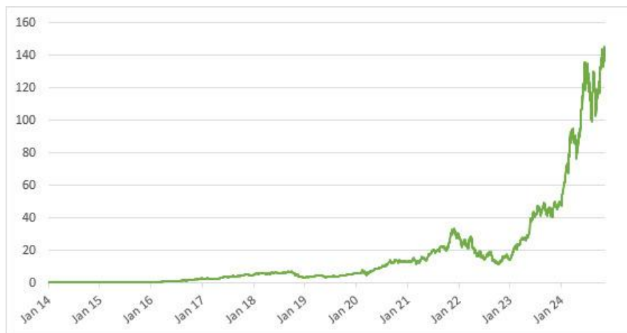
Historical Performance of NVDA

This historical data on NVDA is not necessarily indicative of the future performance of NVDA or what the value of the notes may be. Any historical upward or downward trend in the price per share of NVDA during any period set forth above is not an indication that the price per share of NVDA is more or less likely to increase or decrease at any time over the term of the notes.