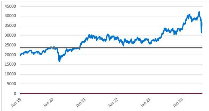
NKY Daily Closing Values January 2, 2019 to August 14, 2024

*The solid line in the graph indicates the hypothetical coupon barrier level and the hypothetical downside threshold level, which in each case is 65% of the hypothetical initial index value on August 14, 2024.