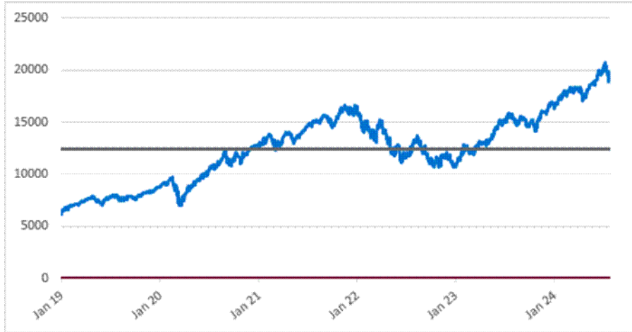
NDX Daily Closing Values January 2, 2019 to July 26, 2024

*The solid line in the graph indicates the coupon barrier level and the downside threshold level, which in each case is 65% of the initial index value.