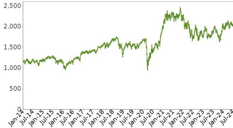
Historical Performance of the Index

This historical data on the Index is not necessarily indicative of the future performance of the Index or what the value of the notes may be. Any historical upward or downward trend in the level of the Index during any period set forth above is not an indication that the level of the Index is more or less likely to increase or decrease at any time over the term of the notes.