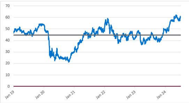
Common Stock of Wells Fargo & Company – Daily Closing Prices January 2, 2019 to July 5, 2024

*The gray solid line indicates the downside threshold price, which is 75% of the initial share price.