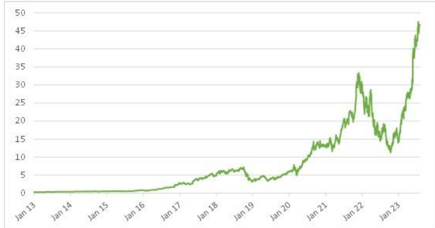
Historical Performance of NVDA

This historical data on NVDA is not necessarily indicative of the future performance of NVDA or what the value of the notes may be. Any historical upward or downward trend in the price per share of NVDA during any period set forth above is not an indication that the price per share of NVDA is more or less likely to increase or decrease at any time over the term of the notes.