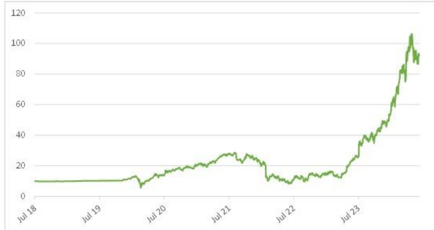
Historical Performance of VRT

This historical data on VRT is not necessarily indicative of the future performance of VRT or what the value of the notes may be. Any historical upward or downward trend in the price per share of VRT during any period set forth above is not an indication that the price per share of VRT is more or less likely to increase or decrease at any time over the term of the notes.