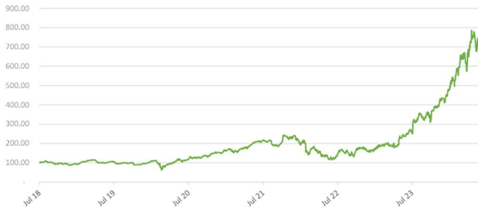
Hypothetical Historical Performance of the Basket

While actual historical information on the Basket will not exist before the pricing date, the following graph sets forth the hypothetical historical daily performance of the Basket from July 30, 2018 (the date VRT began trading) through July 8, 2024. The graph is based upon actual daily historical prices of the Basket Stocks, hypothetical Component Ratios based on the closing prices of the Basket Stocks as of July 27, 2018, and a Basket value of 100.00 as of that date. This hypothetical historical data on the Basket is not necessarily indicative of the future performance of the Basket or what the value of the notes may be. Any hypothetical historical upward or downward trend in the value of the Basket during any period set forth below is not an indication that the value of the Basket is more or less likely to increase or decrease at any time over the term of the notes.