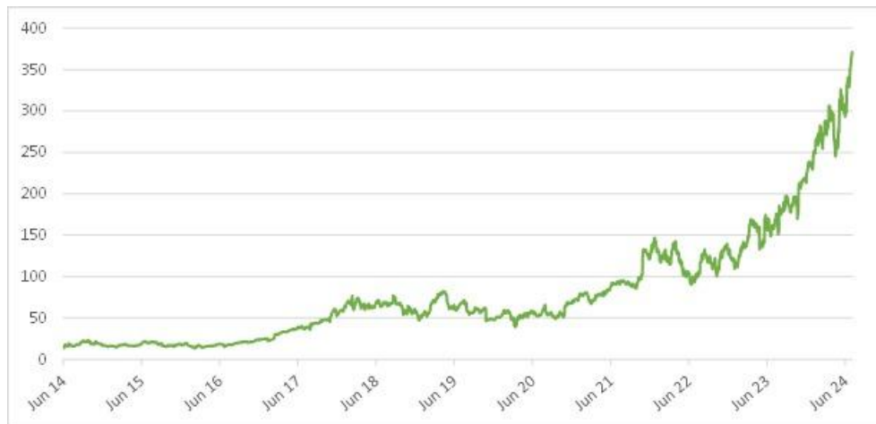
Historical Performance of ANET

This historical data on ANET is not necessarily indicative of the future performance of ANET or what the value of the notes may be. Any historical upward or downward trend in the price per share of ANET during any period set forth above is not an indication that the price per share of ANET is more or less likely to increase or decrease at any time over the term of the notes.