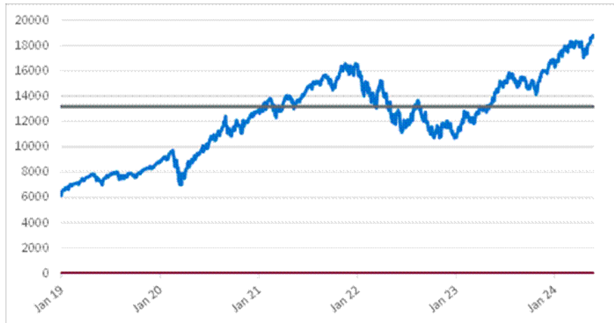
NDX Daily Closing Values January 2, 2019 to May 24, 2024

*The solid line in the graph indicates the coupon barrier level and the downside threshold level, which in each case is 70% of the initial index value.