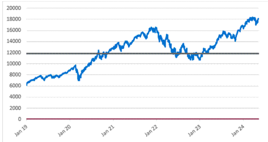
NDX Daily Closing Values January 2, 2019 to May 10, 2024

*The solid line in the graph indicates the coupon barrier level and the downside threshold level, which in each case is 65% of the initial index value.