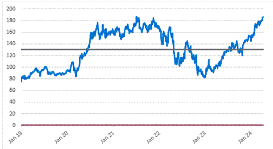
Common Stock of Amazon.com, Inc. – Daily Closing Prices January 2, 2019 to April 10, 2024

*The gray solid line indicates the hypothetical downside threshold price, which is 70% of the hypothetical initial share price as of April 10, 2024.