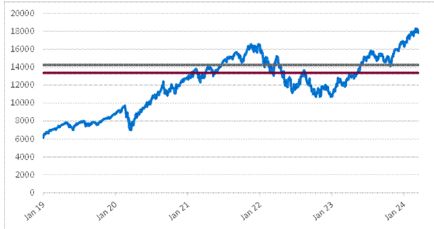
NDX Daily Closing Values January 2, 2019 to March 15, 2024

*The gray solid line in the graph indicates the hypothetical coupon barrier level, which is 80% of the hypothetical initial index value on March 15, 2024, and the crimson solid line in the graph hypothetical downside threshold level, which is 75% of the hypothetical initial index value.