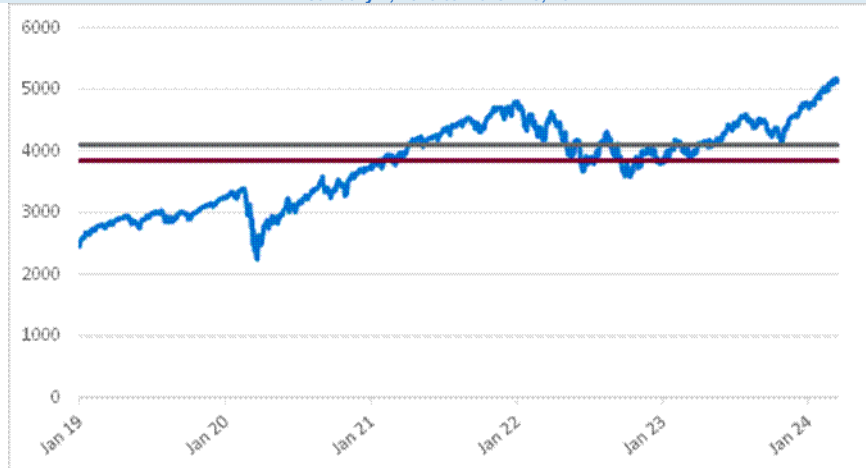
SPX Daily Closing Values January 2, 2019 to March 15, 2024

The following graph sets forth the daily closing values of the SPX for the period from January 2, 2019 through March 15, 2024. The related table sets forth the published high and low closing values, as well as end-of-quarter closing values, of the SPX for each quarter in the same period. The closing value of the SPX on March 15, 2024 was 5,117.09. We obtained the information in the graph and table below from Bloomberg L.P., without independent verification. The SPX has at times experienced periods of high volatility, and you should not take the historical values of the SPX as an indication of its future performance. No assurance can be given as to the level of the SPX during any observation period or on the final observation date.