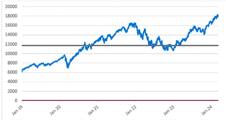
NDX Daily Closing Values January 2, 2019 to March 8, 2024

*The solid line in the graph indicates the coupon barrier level and the downside threshold level, which in each case is 65% of the initial index value.