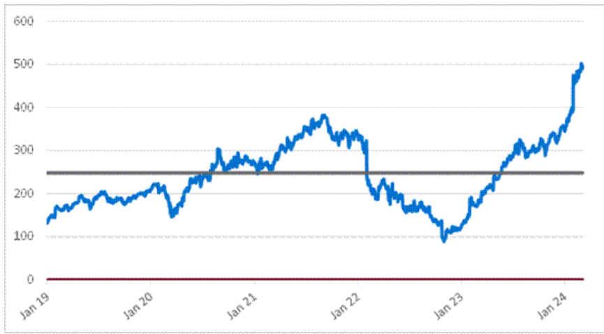
Class A Common Stock of Meta Platforms, Inc. – Daily Closing Prices January 2, 2019 to March 6, 2024

*The gray solid line indicates the hypothetical downside threshold price, which is 50% of the hypothetical initial share price as of March 6, 2024.