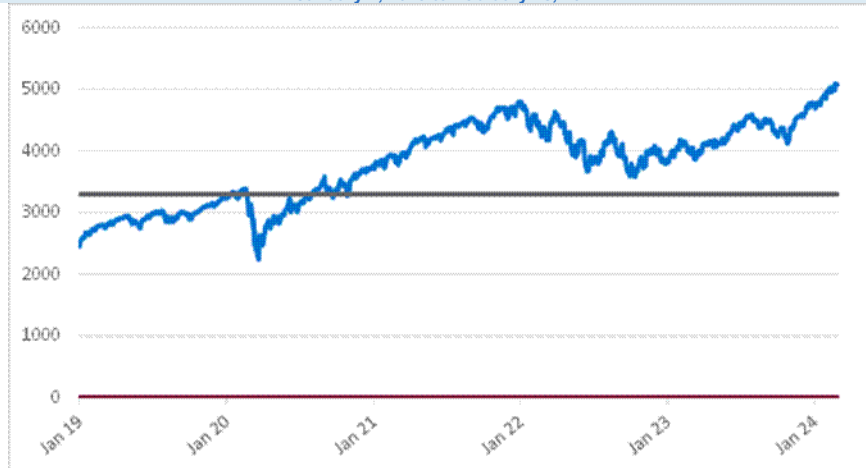
SPX Daily Closing Values January 2, 2019 to February 28, 2024

The following graph sets forth the daily closing values of the SPX for the period from January 2, 2019 through February 28, 2024. The related table sets forth the published high and low closing values, as well as end-of-quarter closing values, of the SPX for each quarter in the same period. The closing value of the SPX on February 28, 2024 was 5,069.76. We obtained the information in the graph and table below from Bloomberg L.P., without independent verification. The SPX has at times experienced periods of high volatility, and you should not take the historical values of the SPX as an indication of its future performance. No assurance can be given as to the level of the SPX during any observation period or on the final observation date.