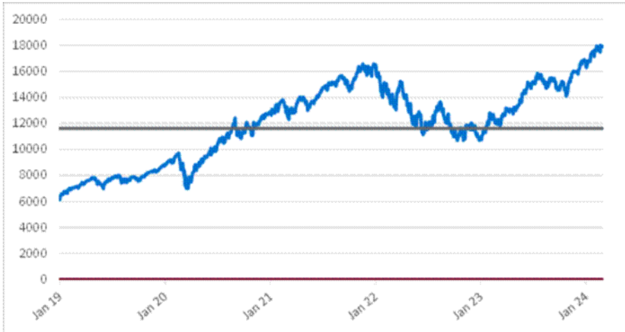
NDX Daily Closing Values January 2, 2019 to February 28, 2024

The following graph sets forth the daily closing values of the NDX for the period from January 2, 2019 through February 28, 2024. The related table sets forth the published high and low closing values, as well as end-of-quarter closing values, of the NDX for each quarter in the same period. The closing value of the NDX on February 28, 2024 was 17,874.50. We obtained the information in the graph and table below from Bloomberg L.P., without independent verification. The NDX has at times experienced periods of high volatility, and you should not take the historical values of the NDX as an indication of its future performance. No assurance can be given as to the level of the NDX during any observation period or on the final observation date.