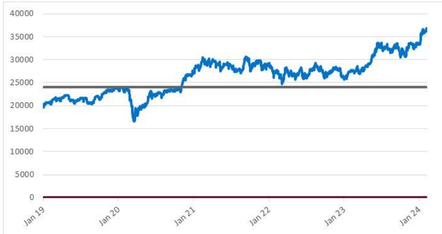
NKY Daily Closing Values January 2, 2019 to February 9, 2024

*The solid line in the graph indicates the coupon barrier level and the downside threshold level, which in each case is 65% of the initial index value.