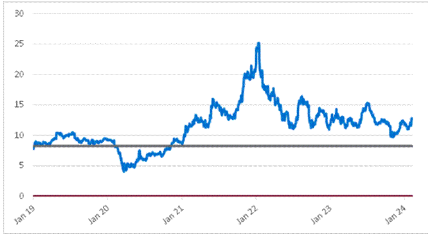
Common Stock of Ford Motor Company – Daily Closing Prices January 2, 2019 to February 9, 2024