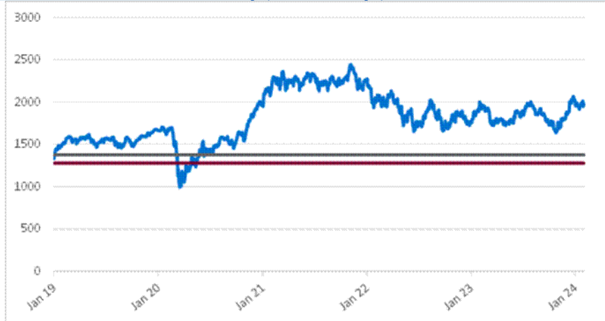
RTY Daily Closing Values January 2, 2019 to February 2, 2024

The following graph sets forth the daily closing values of the RTY for the period from January 2, 2019 through February 2, 2024. The related table sets forth the published high and low closing values, as well as end-of-quarter closing values, of the RTY for each quarter in the same period. The closing value of the RTY on February 2, 2024 was 1,962.731. We obtained the information in the graph and table below from Bloomberg L.P., without independent verification. The RTY has at times experienced periods of high volatility, and you should not take the historical values of the RTY as an indication of its future performance. No assurance can be given as to the level of the RTY on any observation date or on the final observation date.