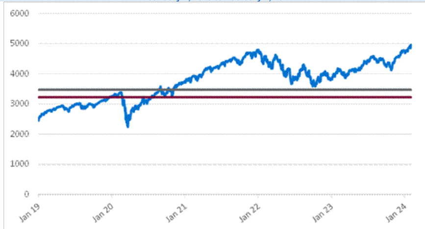
SPX Daily Closing Values January 2, 2019 to February 2, 2024

*The gray solid line in the graph indicates the hypothetical coupon barrier level and the crimson solid line in the graph indicates the hypothetical downside threshold level, in each case assuming the index closing value on February 2, 2024 were the initial index value.