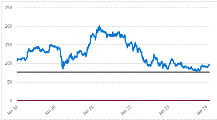
Common Stock of The Walt Disney Company – Daily Closing Prices January 2, 2019 to January 31, 2024

*The gray solid line indicates the hypothetical downside threshold price, which is 80% of the hypothetical initial share price as of January 31, 2024.