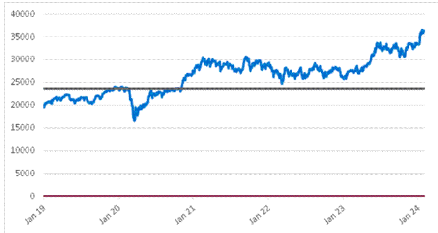
NKY Daily Closing Values January 2, 2019 to January 31, 2024

*The solid line in the graph indicates the hypothetical coupon barrier level and the hypothetical downside threshold level, which in each case is 65% of the hypothetical initial index value on January 31, 2024.