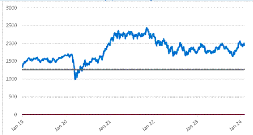
RTY Daily Closing Values January 2, 2019 to January 31, 2024

The following graph sets forth the daily closing values of the RTY for the period from January 2, 2019 through January 31, 2024. The related table sets forth the published high and low closing values, as well as end-of-quarter closing values, of the RTY for each quarter in the same period. The closing value of the RTY on January 31, 2024 was 1,947.342. We obtained the information in the graph and table below from Bloomberg L.P., without independent verification. The RTY has at times experienced periods of high volatility, and you should not take the historical values of the RTY as an indication of its future performance. No assurance can be given as to the level of the RTY during any observation period or on the final observation date.