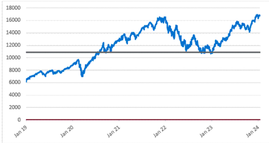
NDX Daily Closing Values January 2, 2019 to January 17, 2024

The following graph sets forth the daily closing values of the NDX for the period from January 2, 2019 through January 17, 2024. The related table sets forth the published high and low closing values, as well as end-of-quarter closing values, of the NDX for each quarter in the same period. The closing value of the NDX on January 17, 2024 was 16,736.28. We obtained the information in the graph and table below from Bloomberg L.P., without independent verification. The NDX has at times experienced periods of high volatility, and you should not take the historical values of the NDX as an indication of its future performance. No assurance can be given as to the level of the NDX during any observation period or on the final observation date.