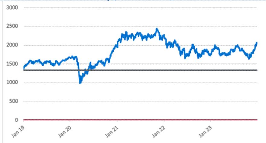
RTY Daily Closing Values January 2, 2018 to December 28, 2023

*The solid line in the graph indicates the coupon barrier level and the downside threshold level, which is 65% of the initial index value.