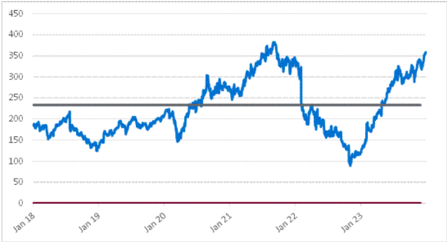
Class A Common Stock of Meta Platforms, Inc. – Daily Closing Prices January 2, 2018 to December 28, 2023

Based on the Performance of the Class A Common Stock of Meta Platforms, Inc. Principal at Risk Securities