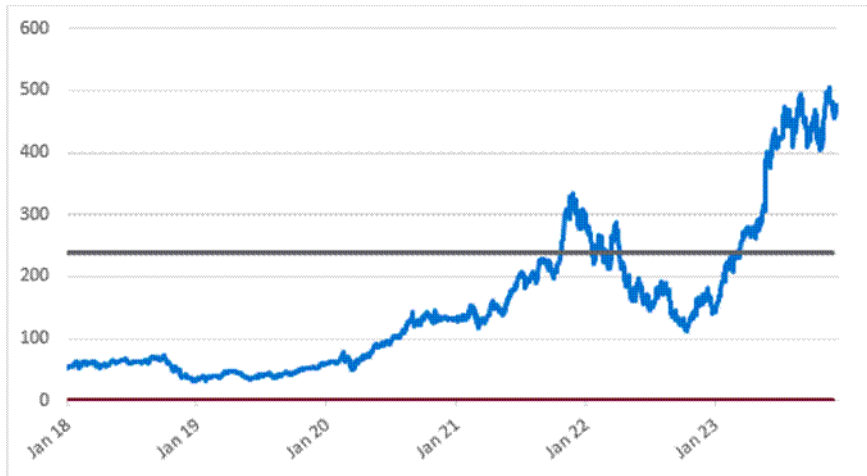
Common Stock of NVIDIA Corporation. – Daily Closing Prices January 2, 2018 to December 12, 2023

*The gray solid line indicates the hypothetical downside threshold price, which is 50% of the hypothetical initial share price as of December 12, 2023.