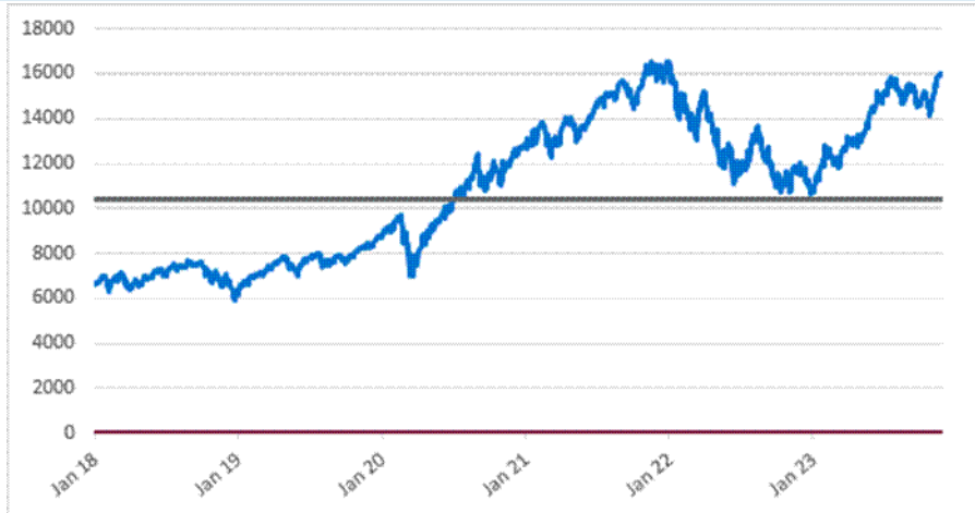
NDX Daily Closing Values January 2, 2018 to November 24, 2023

*The solid line in the graph indicates the coupon barrier level and the downside threshold level, based on the initial index value.