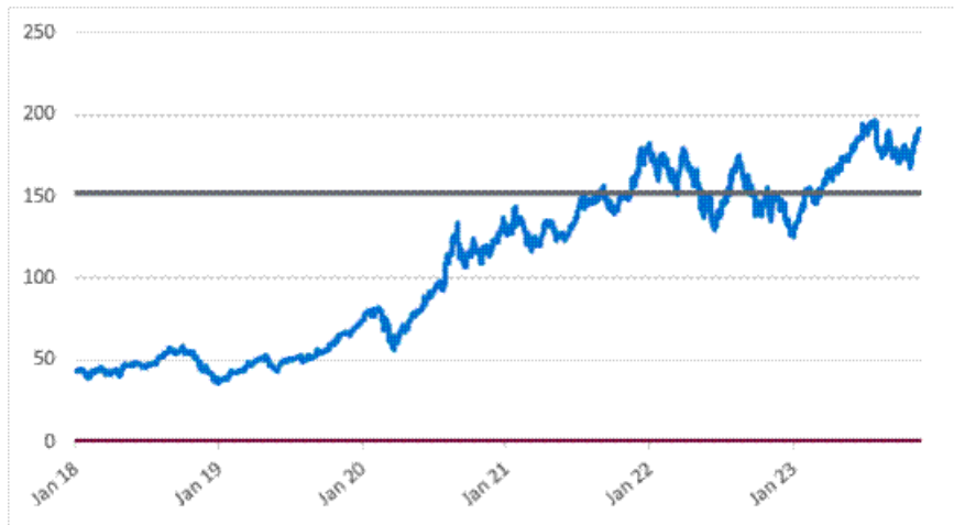
Common Stock of Apple Inc. – Daily Closing Prices January 2, 2018 to November 21, 2023

*The solid line indicates the hypothetical downside threshold price, which is 80% of the hypothetical initial share price as of November 21, 2023.