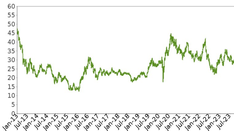
Historical Performance of the Underlying Fund

This historical data on the Underlying Fund is not necessarily indicative of the future performance of the Underlying Fund or what the value of the notes may be. Any historical upward or downward trend in the price of the Underlying Fund during any period set forth above is not an indication that the price of the Underlying Fund is more or less likely to increase or decrease at any time over the term of the notes.