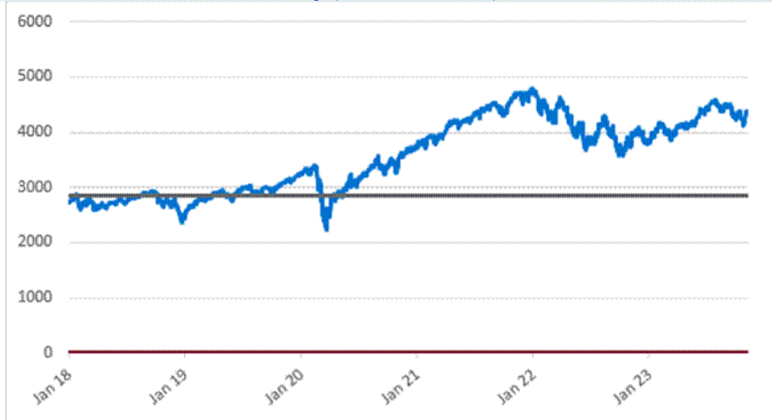
SPX Daily Closing Values January 2, 2018 to November 7, 2023

The following graph sets forth the daily closing values of the SPX for the period from January 2, 2018 through November 7, 2023. The related table sets forth the published high and low closing values, as well as end-of-quarter closing values, of the SPX for each quarter in the same period. The closing value of the SPX on November 7, 2023 was 4,378.38. We obtained the information in the graph and table below from Bloomberg L.P., without independent verification. The SPX has at times experienced periods of high volatility, and you should not take the historical values of the SPX as an indication of its future performance. No assurance can be given as to the level of the SPX during any observation period or on the final observation date.