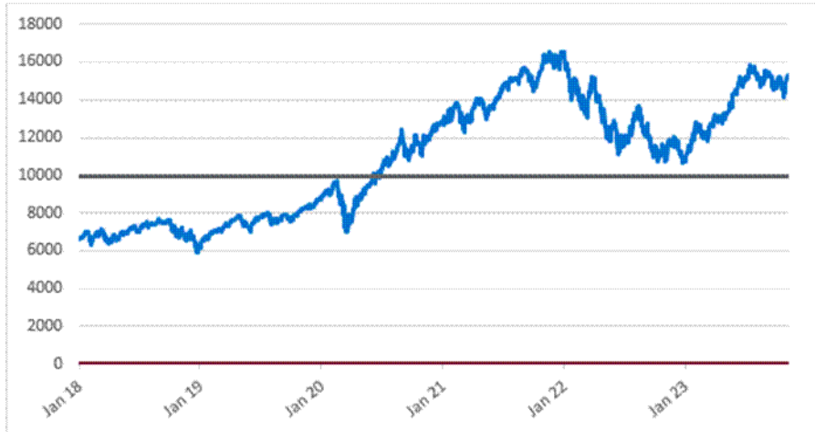
NDX Daily Closing Values January 2, 2018 to November 7, 2023

The following graph sets forth the daily closing values of the NDX for the period from January 2, 2018 through November 7, 2023. The related table sets forth the published high and low closing values, as well as end-of-quarter closing values, of the NDX for each quarter in the same period. The closing value of the NDX on November 7, 2023 was 15,296.02. We obtained the information in the graph and table below from Bloomberg L.P., without independent verification. The NDX has at times experienced periods of high volatility, and you should not take the historical values of the NDX as an indication of its future performance. No assurance can be given as to the level of the NDX during any observation period or on the final observation date.