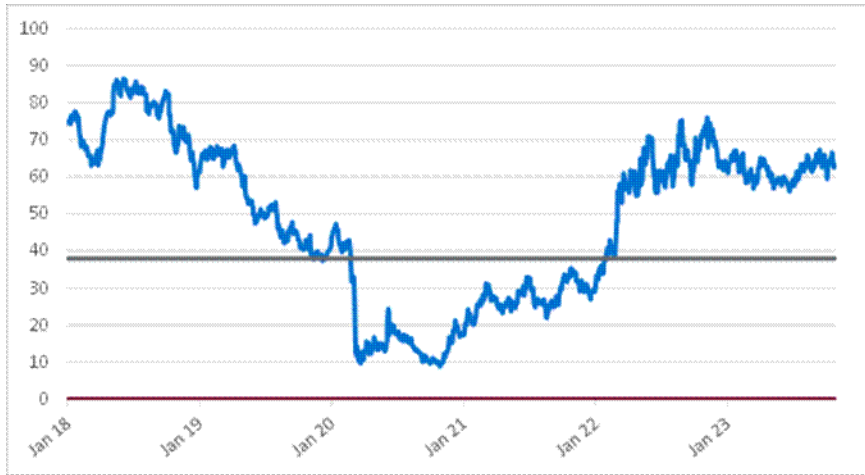
Common Stock of Occidental Petroleum Corporation – Daily Closing Prices January 2, 2018 to November 3, 2023

*The solid line indicates the downside threshold price, which is 60% of the initial share price.