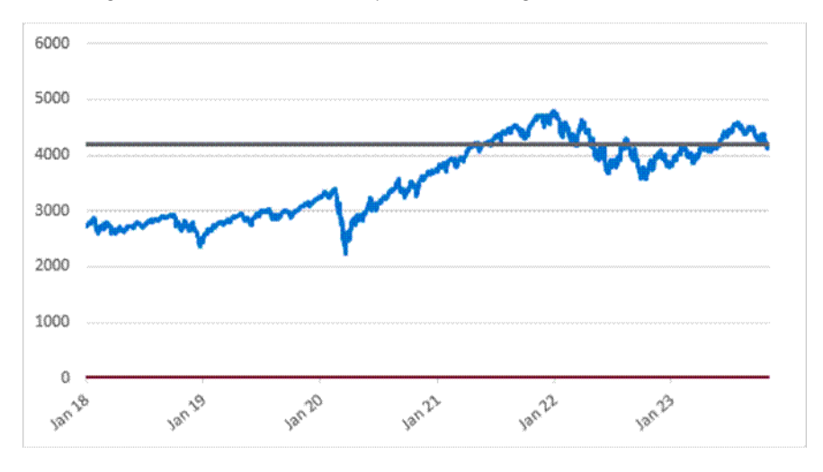
CAPPED ENHANCED RETURN NOTES | PS-11

The following graph sets forth the daily historical performance of the SPX in the period from January 3, 2017 through the pricing date. We obtained this historical data from Bloomberg L.P. We have not independently verified the accuracy or completeness of the information obtained from Bloomberg L.P. The hypothetical Starting Value of the SPX is 4,193.80, which was its closing level on the pricing date. The actual Starting Value will be determined after the expiration of the Starting Value Determination Period.