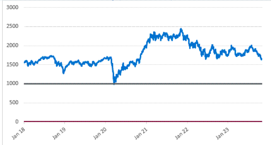
RTY Daily Closing Values January 2, 2018 to October 31, 2023

The following graph sets forth the daily closing values of the RTY for the period from January 2, 2018 through October 31, 2023. The related table sets forth the published high and low closing values, as well as end-of-quarter closing values, of the RTY for each quarter in the same period. The closing value of the RTY on October 31, 2023 was 1,662.282. We obtained the information in the graph and table below from Bloomberg L.P., without independent verification. The RTY has at times experienced periods of high volatility, and you should not take the historical values of the RTY as an indication of its future performance. No assurance can be given as to the level of the RTY during any observation period or on the final observation date.