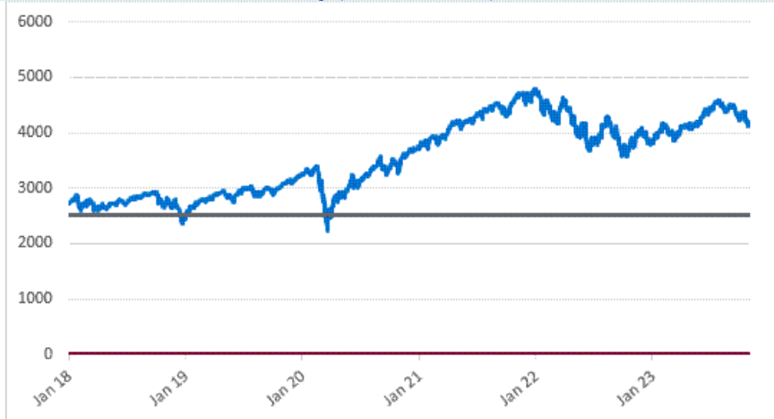
SPX Daily Closing Values January 2, 2018 to October 31, 2023

The following graph sets forth the daily closing values of the SPX for the period from January 2, 2018 through October 31, 2023. The related table sets forth the published high and low closing values, as well as end-of-quarter closing values, of the SPX for each quarter in the same period. The closing value of the SPX on October 31, 2023 was 4,193.80. We obtained the information in the graph and table below from Bloomberg L.P., without independent verification. The SPX has at times experienced periods of high volatility, and you should not take the historical values of the SPX as an indication of its future performance. No assurance can be given as to the level of the SPX during any observation period or on the final observation date.