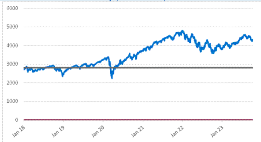
SPX Daily Closing Values January 2, 2018 to October 6, 2023

*The solid line in the graph indicates the coupon barrier level and the downside threshold level, in each case based on the initial index value.