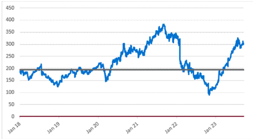
Class A Common Stock of Meta Platforms, Inc. – Daily Closing Prices January 2, 2018 to September 20, 2023

*The gray solid line indicates the hypothetical downside threshold price, which is 65% of the hypothetical initial share price as of September 20, 2023.