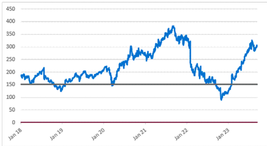
Class A Common Stock of Meta Platforms, Inc. – Daily Closing Prices January 2, 2018 to September 13, 2023

*The gray solid line indicates the hypothetical downside threshold price, which is 60% of the hypothetical initial share price as of September 13, 2023.