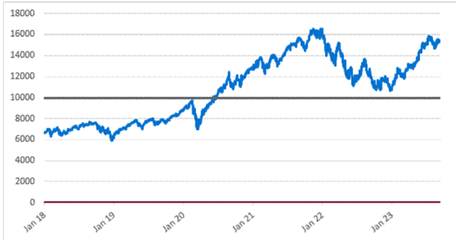
NDX Daily Closing Values January 2, 2018 to September 13, 2023

*The solid line in the graph indicates the hypothetical coupon barrier level and the hypothetical downside threshold level, in each case assuming the index closing value on September 13, 2023 were the initial index value.