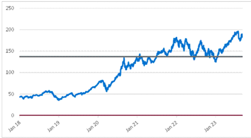
Common Stock of Apple Inc. – Daily Closing Prices January 2, 2018 to September 6, 2023

*The solid line indicates the hypothetical downside threshold price, which is 75% of the hypothetical initial share price as of September 6, 2023.