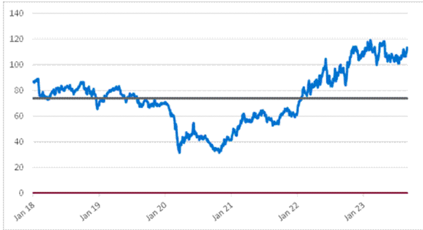
Common Stock of Exxon Mobil Corporation. – Daily Closing Prices January 2, 2018 to September 1, 2023

*The gray solid line indicates the downside threshold price, which is 65% of the initial share price.