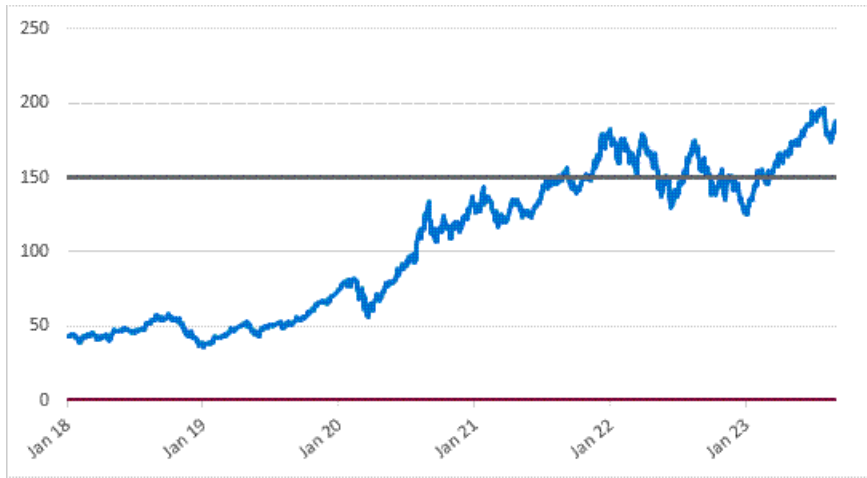
Common Stock of Apple Inc. – Daily Closing Prices January 2, 2018 to August 30, 2023

*The solid line indicates the hypothetical downside threshold price, which is 80% of the hypothetical initial share price as of August 30, 2023.