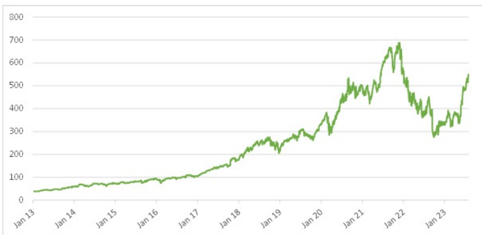
Historical Performance of the Underlying Stock

This historical data on the Underlying Stock is not necessarily indicative of the future performance of the Underlying Stock or what the value of the notes may be. Any historical upward or downward trend in the price per share of the Underlying Stock