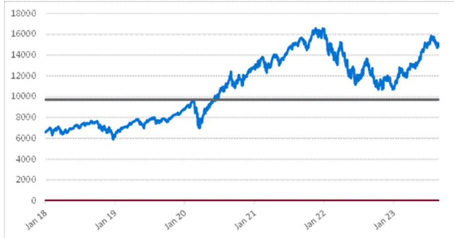
NDX Daily Closing Values January 2, 2018 to August 25, 2023

The following graph sets forth the daily closing values of the NDX for the period from January 2, 2018 through the pricing date. The related table sets forth the published high and low closing values, as well as end-of-quarter closing values, of the NDX for each quarter in the same period. The closing value of the NDX on the pricing date was 14,941.83. We obtained the information in the graph and table below from Bloomberg L.P., without independent verification. The NDX has at times experienced periods of high volatility, and you should not take the historical values of the NDX as an indication of its future performance. No assurance can be given as to the level of the NDX during any observation period or on the final observation date.