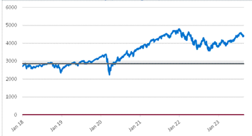
SPX Daily Closing Values January 2, 2018 to August 25, 2023

The following graph sets forth the daily closing values of the SPX for the period from January 2, 2018 through the pricing date. The related table sets forth the published high and low closing values, as well as end-of-quarter closing values, of the SPX for each quarter in the same period. The closing value of the SPX on the pricing date was 4,405.71. We obtained the information in the graph and table below from Bloomberg L.P., without independent verification. The SPX has at times experienced periods of high volatility, and you should not take the historical values of the SPX as an indication of its future performance. No assurance can be given as to the level of the SPX during any observation period or on the final observation date.