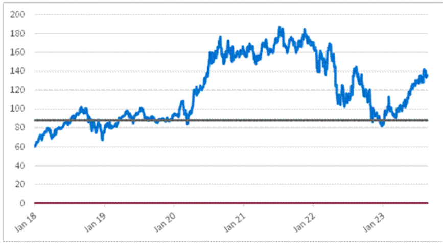
Common Stock of Amazon.com, Inc. – Daily Closing Prices January 2, 2018 to August 23, 2023

*The gray solid line indicates the hypothetical downside threshold price, which is 65% of the hypothetical initial share price as of August 23, 2023.