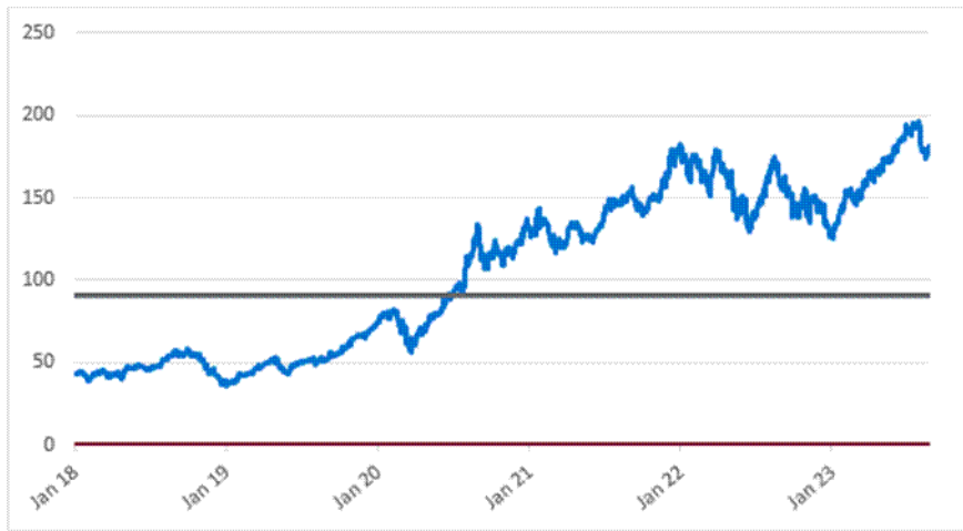
Common Stock of Apple Inc. – Daily Closing Prices January 2, 2018 to August 23, 2023

*The solid line indicates the hypothetical downside threshold price, which is 75% of the hypothetical initial share price as of August 23, 2023.