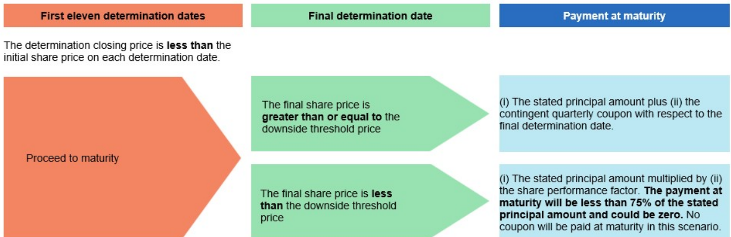
Diagram #2: Payment at Maturity if No Automatic Early Redemption Occurs