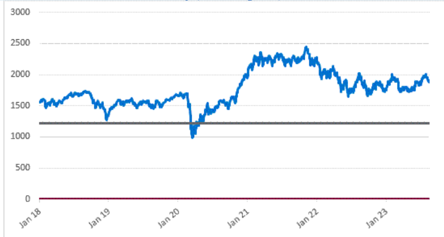
RTY Daily Closing Values January 2, 2018 to August 16, 2023

The following graph sets forth the daily closing values of the RTY for the period from January 2, 2018 through August 16, 2023. The related table sets forth the published high and low closing values, as well as end-of-quarter closing values, of the RTY for each quarter in the same period. The closing value of the RTY on August 16, 2023 was 1,871.519. We obtained the information in the graph and table below from Bloomberg L.P., without independent verification. The RTY has at times experienced periods of high volatility, and you should not take the historical values of the RTY as an indication of its future performance. No assurance can be given as to the level of the RTY during any observation period or on the final observation date.