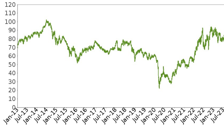
Historical Performance of the Underlying Fund

This historical data on the Underlying Fund is not necessarily indicative of the future performance of the Underlying Fund or what the value of the notes may be. Any historical upward or downward trend in the price of the Underlying Fund during any period set forth above is not an indication that the price of the Underlying Fund is more or less likely to increase or decrease at any time over the term of the notes.