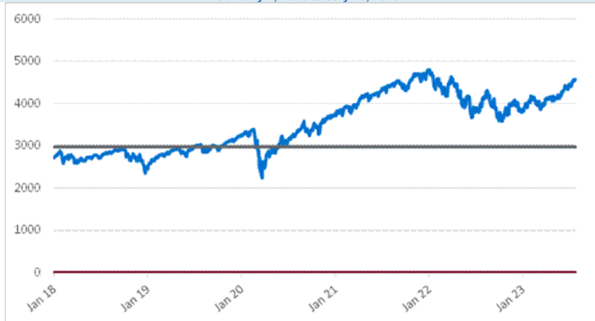
SPX Daily Closing Values January 2, 2018 to July 25, 2023

The following graph sets forth the daily closing values of the SPX for the period from January 2, 2018 through July 25, 2023. The related table sets forth the published high and low closing values, as well as end-of-quarter closing values, of the SPX for each quarter in the same period. The closing value of the SPX on July 25, 2023 was 4,567.46. We obtained the information in the graph and table below from Bloomberg L.P., without independent verification. The SPX has at times experienced periods of high volatility, and you should not take the historical values of the SPX as an indication of its future performance. No assurance can be given as to the level of the SPX during any observation period or on the final observation date.