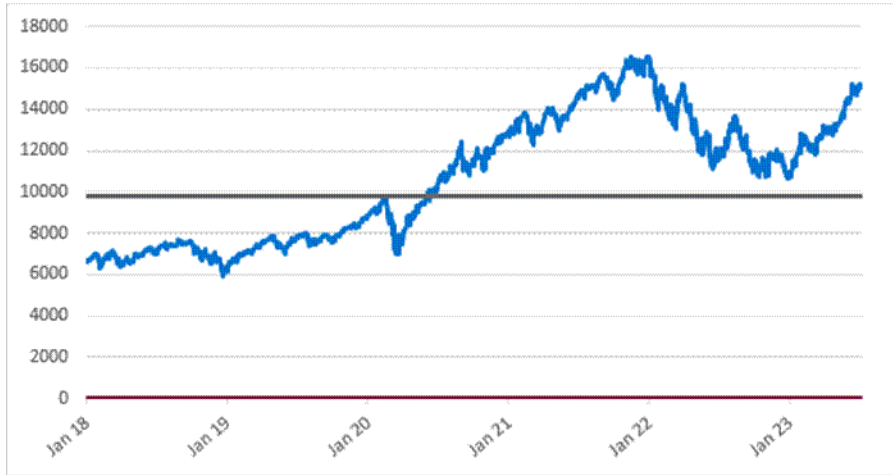
NDX Daily Closing Values January 2, 2018 to July 7, 2023

*The solid line in the graph indicates the coupon barrier level and the downside threshold level based on the initial index value.