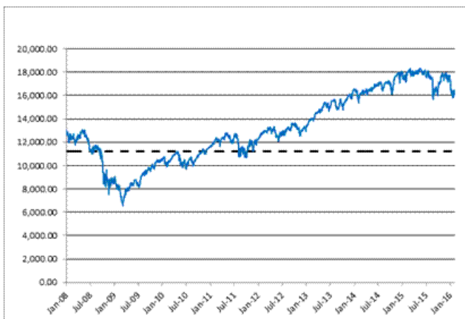
Historical Performance of the INDU

Before investing in the notes, you should consult publicly available sources for the levels of the INDU.